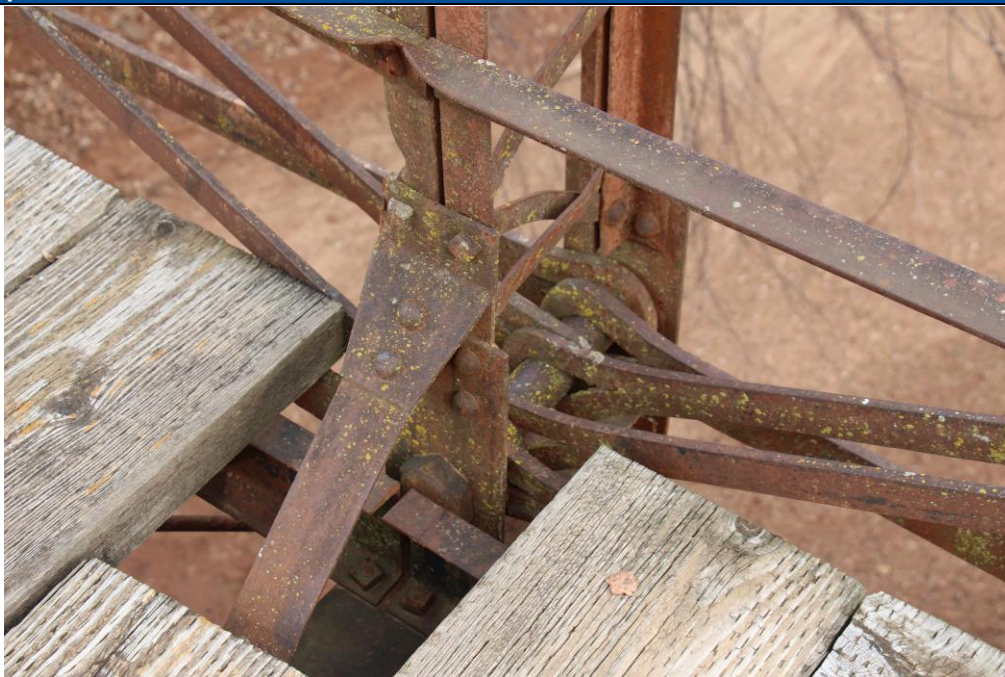
Photograph Date: January 21, 2020 Camera Direction: NE