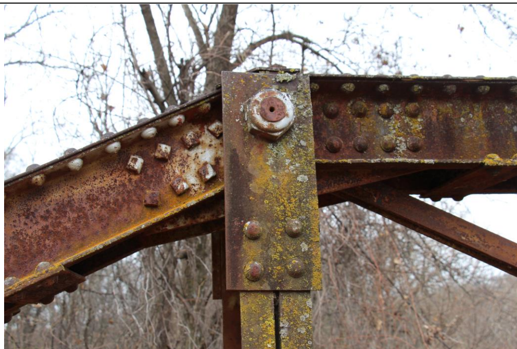
Photograph Date: January 21, 2020 Camera Direction: W