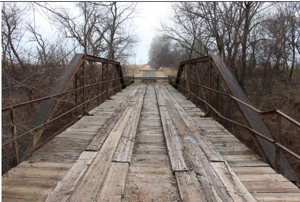
Photograph Date: January 21, 2020 Camera Direction: SW