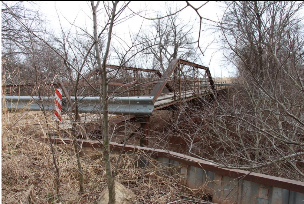
Photograph Date: January 21, 2020 Camera Direction: S