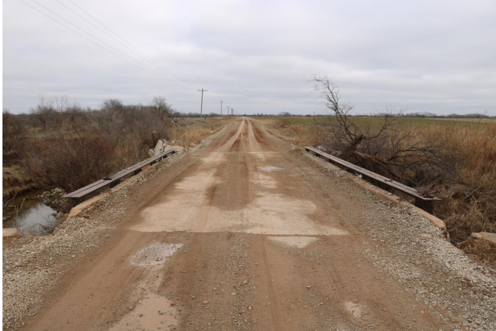
Photograph Date: January 29, 2020 Camera Direction: E