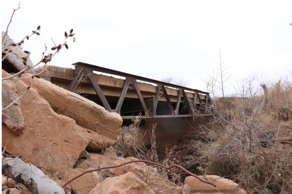
Photograph Date: January 29, 2020 Camera Direction: SW