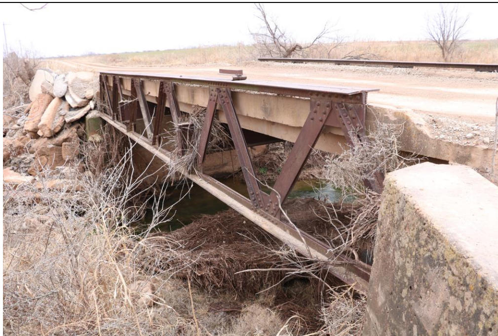
Photograph Date: January 29, 2020 Camera Direction: SE