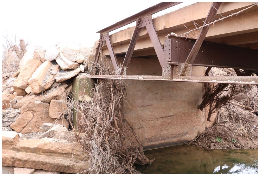
Photograph Date: January 29, 2020 Camera Direction: SE