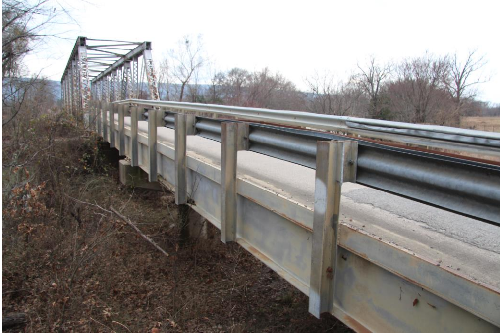
Photograph Date: January 15, 2020 Camera Direction: S