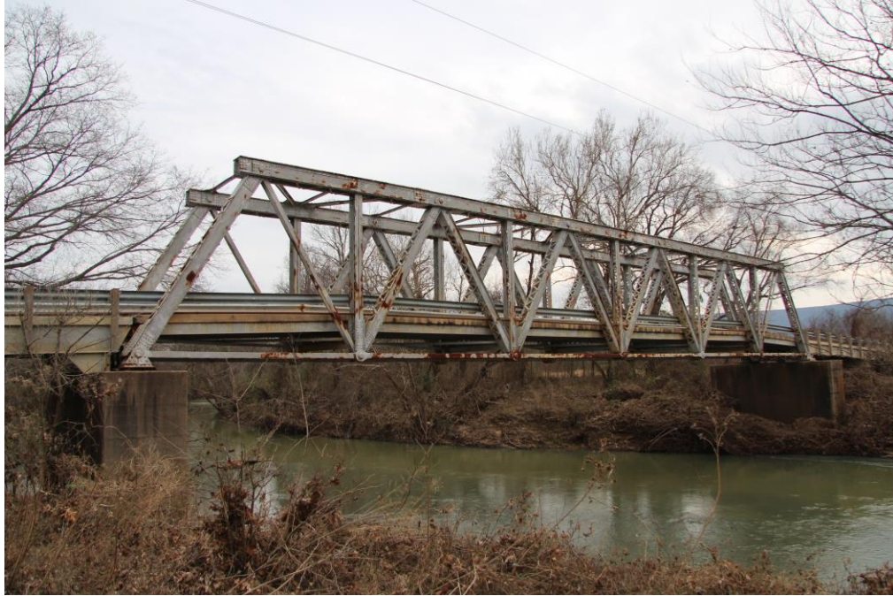
Photograph Date: January 15, 2020 Camera Direction: SE