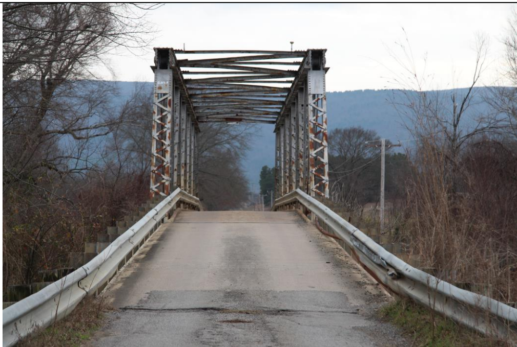
Photograph Date: January 15, 2020 Camera Direction: S