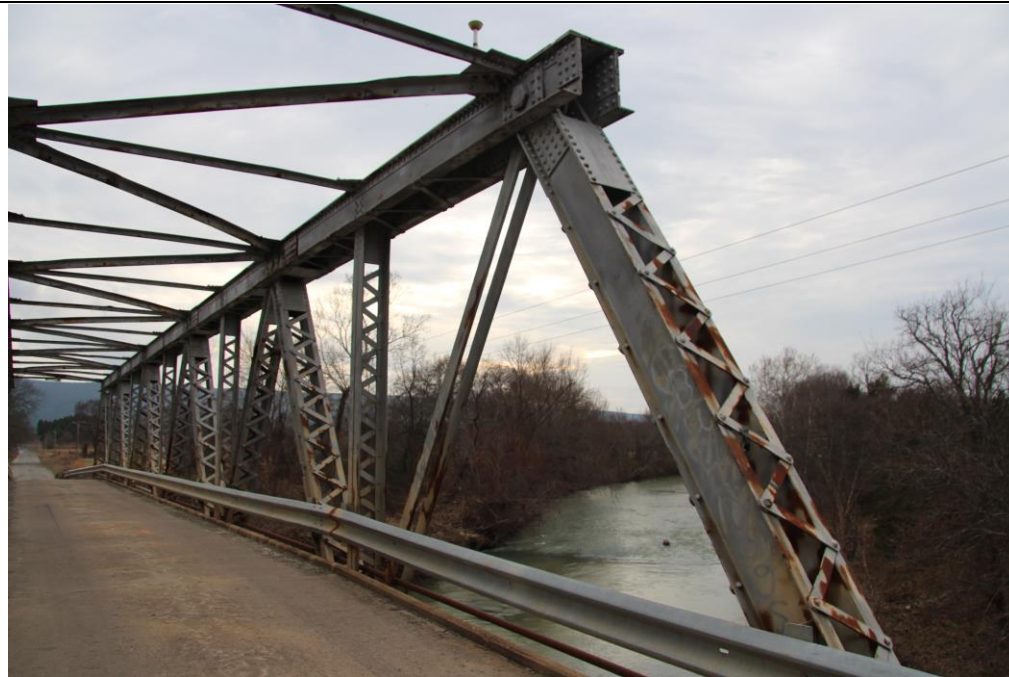
Photograph Date: January 15, 2020 Camera Direction: S