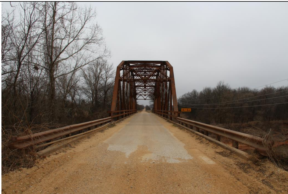
Photograph Date: January 9, 2020 Camera Direction: S