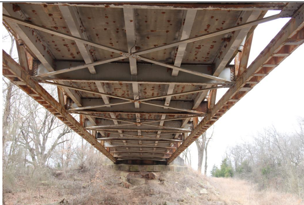
Photograph Date: January 9, 2020 Camera Direction: S