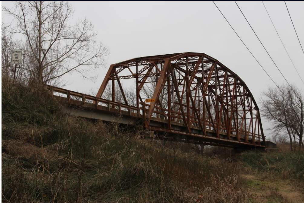
Photograph Date: January 9, 2020 Camera Direction: SE