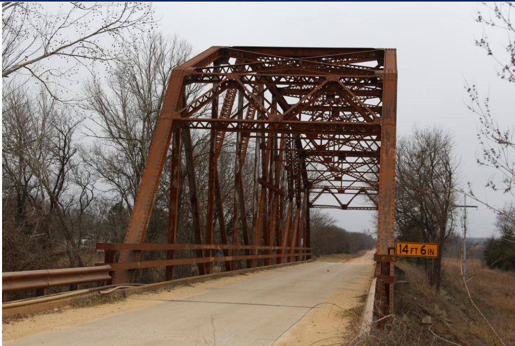
Photograph Date: January 9, 2020 Camera Direction: SE