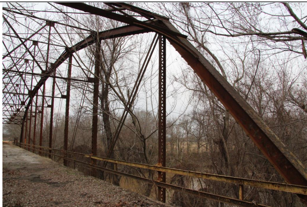
Photograph Date: January 16, 2020 Camera Direction: SE