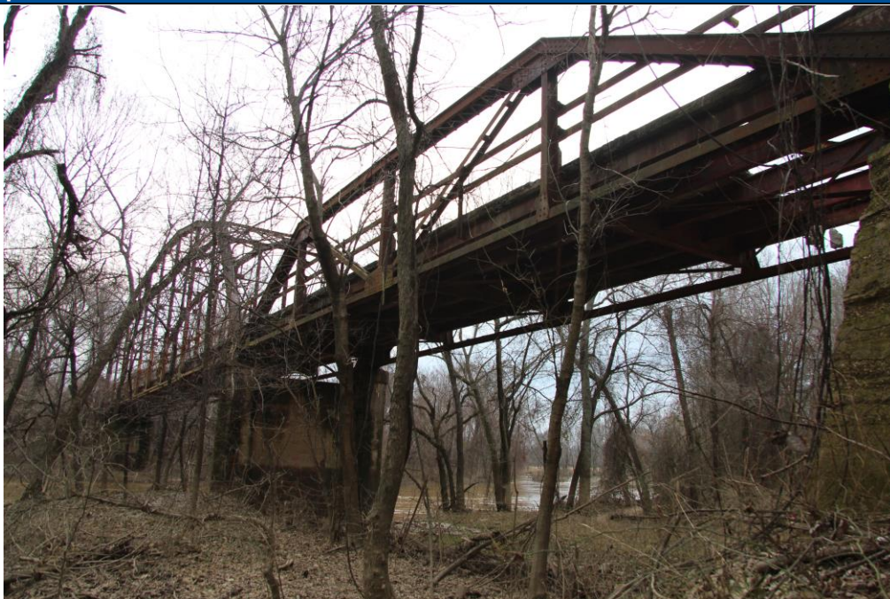
Photograph Date: January 16, 2020 Camera Direction: SE